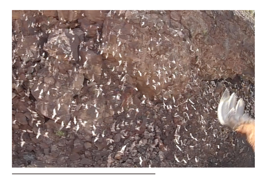
Still frame captured by the video recording unit during hawk flight through the bats.

For the people of I-PEX Connectors, measuring success means continuing to provide state-of-the-art advancements that solve the needs of the technology industry, as well as providing highly customized solutions for people, companies and organizations that continue to reshape the way we will live.